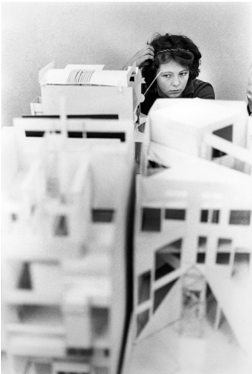
Image: Undergraduate Jury, 1982